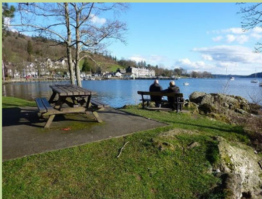
Waterhead from Borrans Park

As the name suggests, Waterhead marks the head of Windermere lake and you will find quite a few attractions in this attractive village near to Ambleside town. The most obvious feature is the lake and there is plenty of shoreline access with excellent views across the water. The small promenade makes a pleasant stroll and there are a few benches from where you can watch the boats coming and going. Windermere Lake Cruises call at the main pier here and you can take a scenic red cruise to Bowness and Lakeside or a seasonal Green cruise to nearby Wray Castle and Brockhole.