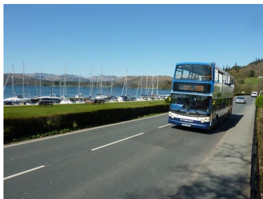
555 bus at Low Wood

Take the open top bus from Grasmere village, returning to Bowness-on-Windermere. You get a different perspective of the wonderful scenery in the opposite direction as you pass Grasmere and Rydal Water lakes, through Ambleside and Waterhead then along the shores of Windermere lake. You pass Brockhole visitor centre on the lake shore and continue to Windermere railway station before heading through Windermere town to Bowness-on-Windermere.