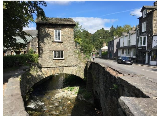
Bridge House, Ambleside

Take the bus from Waterhead (Ambleside) to Rydal village. The bus passes through Ambleside town and you can alight here if you want to explore the town (buses stop in the town centre on Kelsick Road). Or, it is an easy walk along the road from Waterhead to Ambleside, approx 1 mile. The bus passes the iconic Bridge House as you leave Ambleside and heads into glorious Lake District mountain scenery before soon arriving at Rydal village.