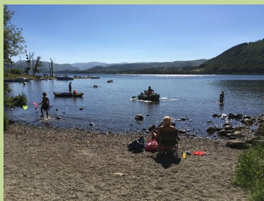
Pooley Bridge lakeside

Buses stop in the village centre and at the Ullswater Steamers pier which is approx 0.3 miles from the village centre.