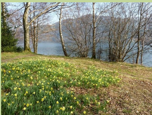
Daffodils at Glencoyne

Glencoyne bay provides a scenic lakeshore area with narrow shingle beaches next to the road and wonderful views across the lake. You can follow the good footpath in either direction adjacent to the road if you want to explore nearby shoreline. Behind the car park, the wonderful Glencoyne valley heads inland from the lake and you can explore it on foot on the Glencoyne Farm trail . There are no facilities on site. Buses stop at Glencoyne car park.