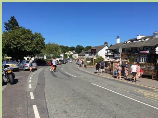
Pooley Bridge village

Pooley Bridge is a busy tourist village located at the northern end of Ullswater lake. There are a few shops, pubs and cafes although there isn't much else to see in the village itself. The area is popular with campers and caravaners who come from the many nearby sites. There are some good walks in the area but the main attraction are the Ullswater Steamers which can be caught from the nearby pier. Regular boats travel up the magnificent lake with various stops along the way. The historic road bridge over the River Eamont was famously destroyed in December 2015 by storm Desmond, the new bridge was opened in 2020. Public toilets in the village.